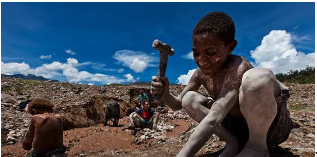
Many families eke out a living by illegally mining in Porgera.

By Catherine Wilson, New Zealand Herald, Sep 12, 2015 Cash settlements intended for women abused by gold mine security staff claimed by wider family, while perpetrators get away scot-free.