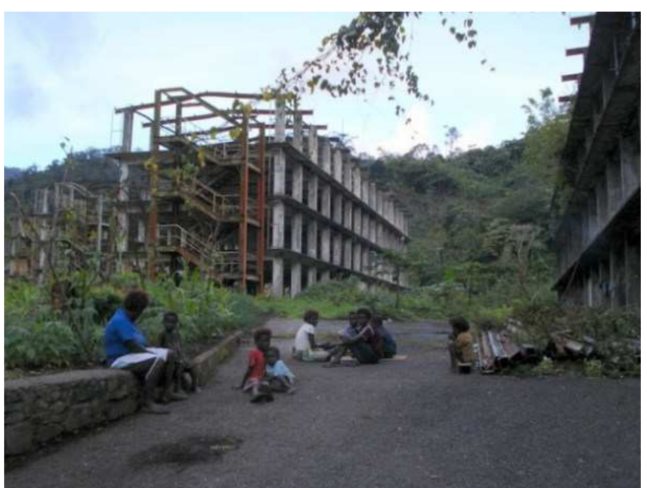
Women and children sit among the ruins of the mine administration buildings.

The decade-long civil war, unleashed on the indigenous inhabitants of Bouainville between 1988 and 1998 is unique in recent South Pacific history. Directly and indirectly it cost the lives of up to 20,000 children, women and men. Although there were several reasons why it lasted lasted so long, it was primarily the presence of the island's massive Rio Tinto-owned Panguna copper-gold mine which triggered the rebellion that quickly resulted in a horrendous, bloody, conflict, characterised by numerous atrocities. It is now seven years since a reconciliation process between the combatants was brokered by the New Zealand government. So far, peace has largely prevailed. Nonetheless vigorous disagreement exists between various land-owner groups and the Bougainville Autonomous Government, over one burning issue: Should the Panguna mine be re-opened by BCL, Rio Tinto's