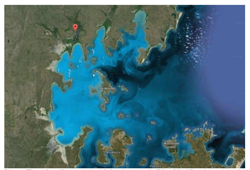
Photo: There is a dispute over mining interests in Blue Mud Bay in east Arnhem Land.

By Daniel Fitzgerald, ABC Radio Australia, October 1, 2015